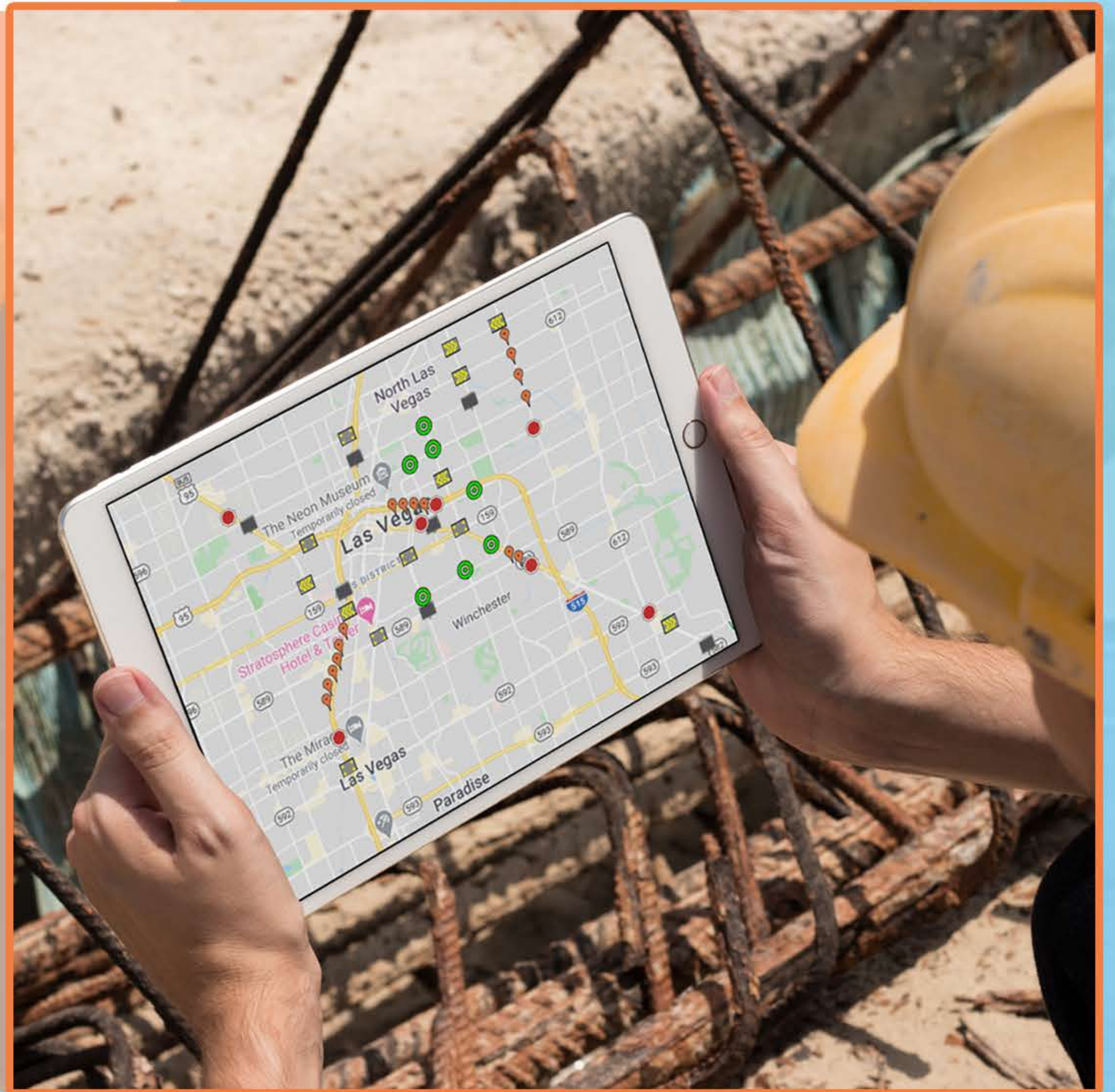
On-site project management interface